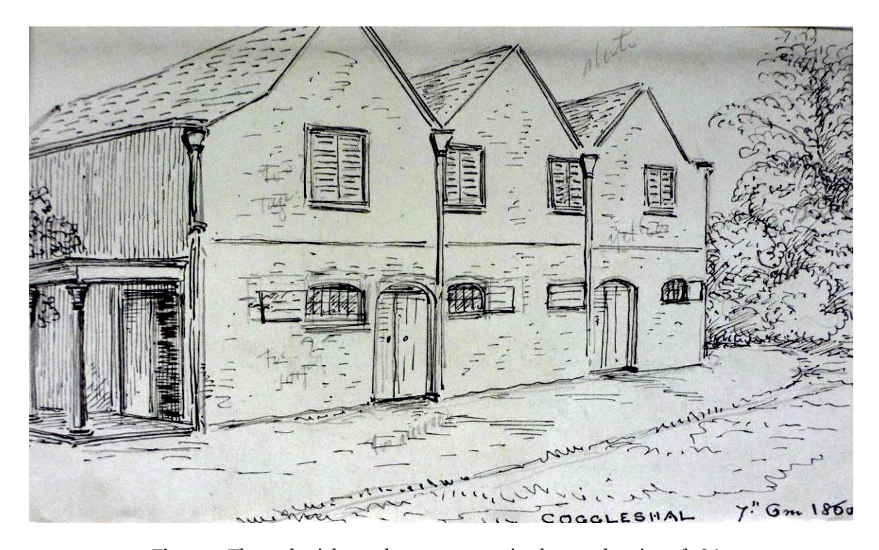
Figure 1: The early eighteenth-century meeting house, drawing of 1860

The burial ground to the west was extended in 1783 but went out of use in 1856. It now forms part of the land belonging to a modern housing development. Two headstones of 1855 remain close to the eastern boundary wall, for which drawings and transcriptions exist in the County Historic Environment Record (SMR no.8734).